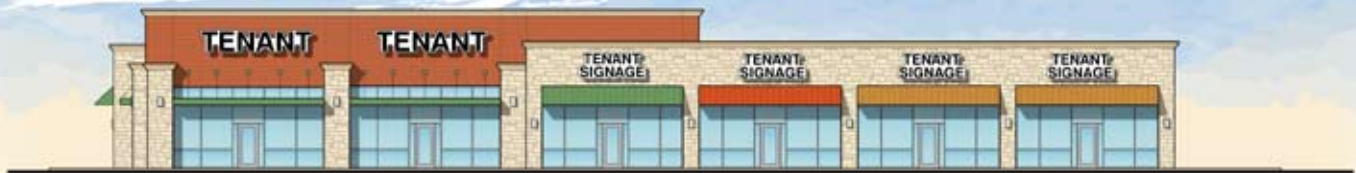
BUILDING ELEVATION - EAST